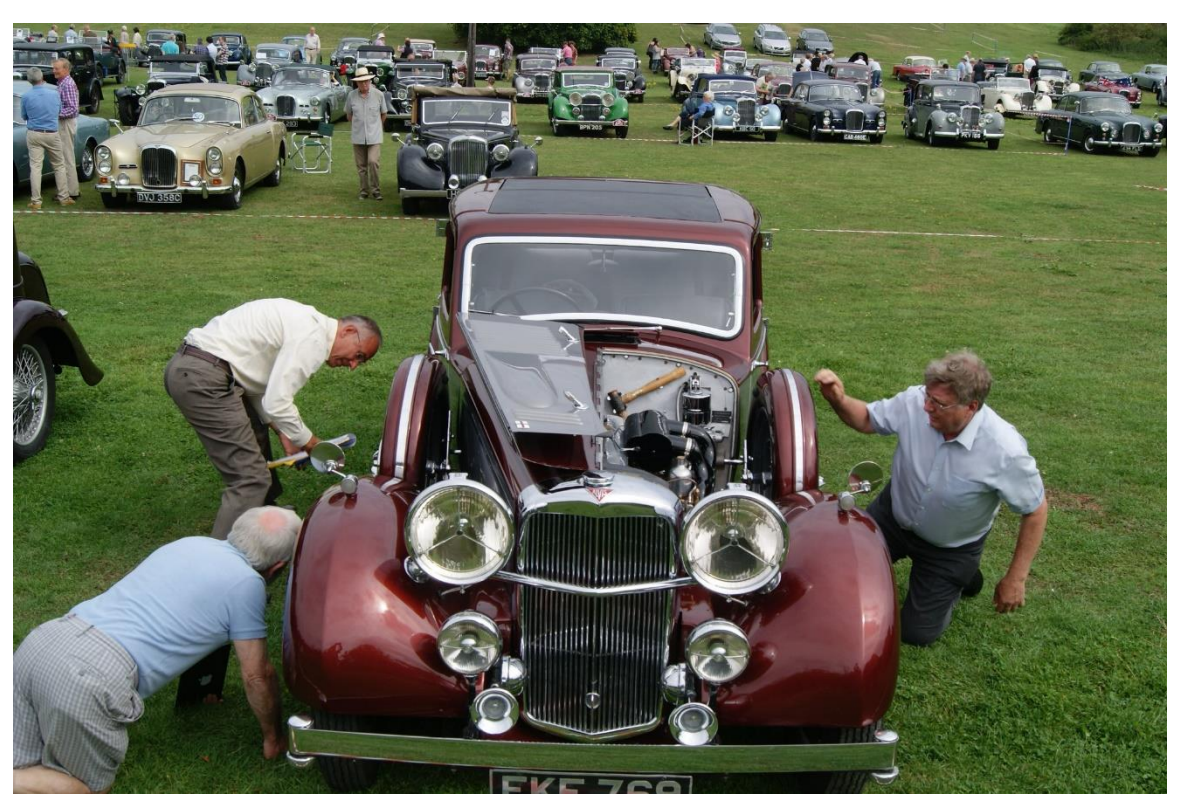
The AOC web Forum can help you sort this out online!

The Forum differs from the AOC Facebook Group in that the Forum is a permanent repository of information , so if you have an issue, you can search the Forum and see if other members have had similar issues in the past. The Forum has retained all the information and posts from the previous Bulletin Board, so it has information going back for many years with over 2,500 posts from members.